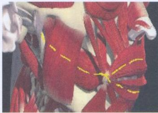
Figure 2. Oral chamber [1]