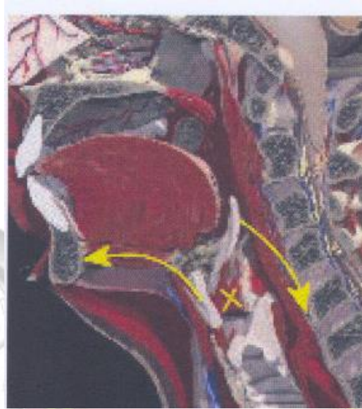
Figure 8. Laryngeal seal [1]