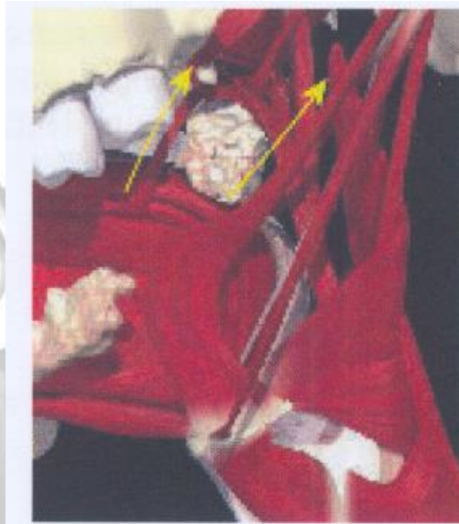
Figure 5. Oropharyngeal seal [1]

tongue backward at the beginning of the pharyngeal phase, propelling the bolus into the pharynx. This results in increased oro-pharyngeal pressure, increased intra bolus pressure and effectively seals off the oral cavity from the oro-pharynx.