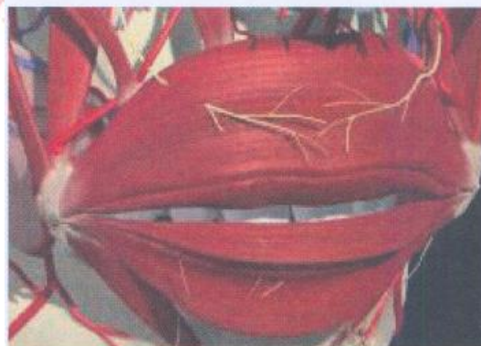
Figure 1. Lip seal [1]