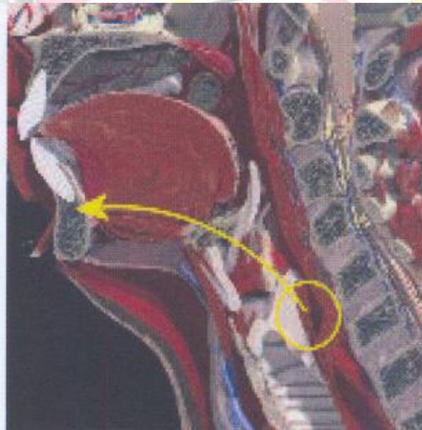
Figure 7. Hyolaryngeal excursion [1]