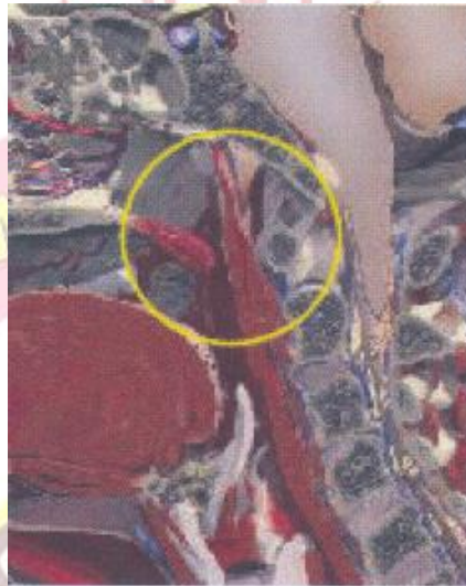
Figure 3. Velopharyngeal seal [1]