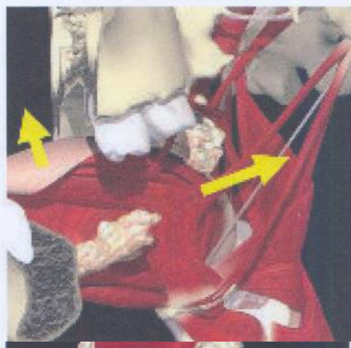
Figure 4. Tongue base retraction [1]