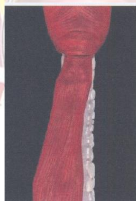
Figure 10. Compression esophageal chamber [1]